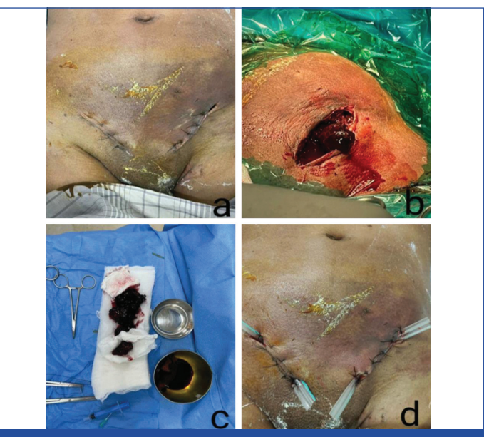
[Table/Fig-7]: Haematoma collection in postherniplasty: a) Skin discoloration was noted over the operated site on POD#3; b) Intraoperative finding of haematoma collection, a small bleed was noted which was arrested; c) Evacuated haematoma from surgical site; d) Corrugated rubber drain was placed insitu and wound closed in layers.

Comparing the duration of surgery, 81 patients had surgery in less than 30 minutes, in which 44 patients (54%) belonged to group A and 37 patients (58%) belonged to group B, in which two patients of group B (4%) developed SSI.